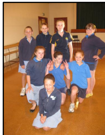
The girls in the Waikari School Dance Squad